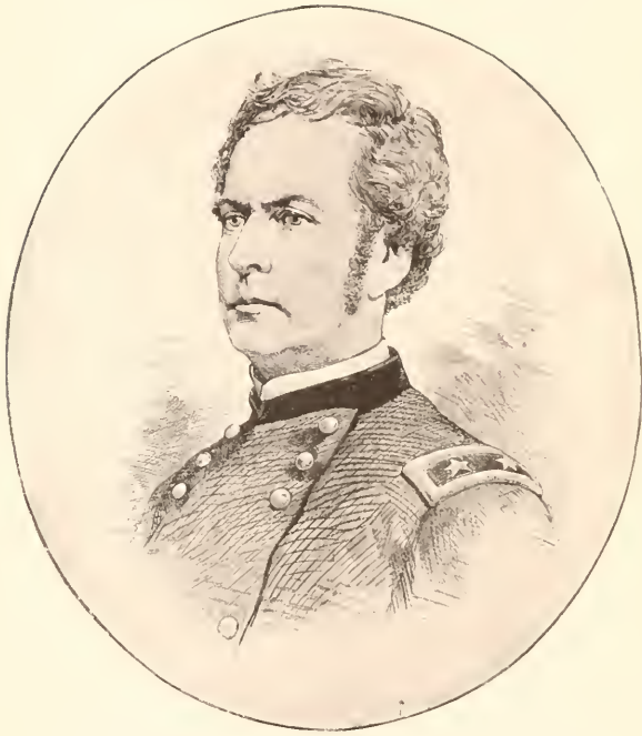
MAJOR-GENERAL JOSEPH HOOKER, U. S. A.